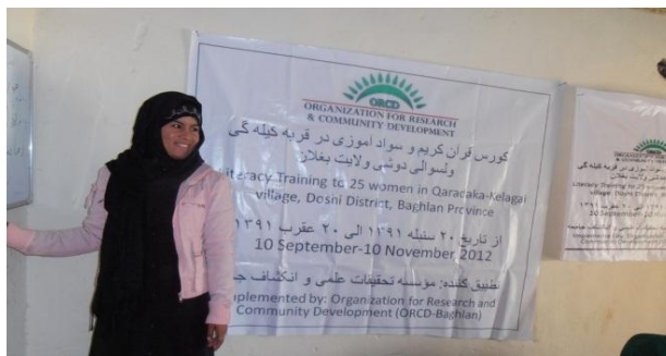
Literacy training sessions in Kelagai village funded by Aga Khan Foundation