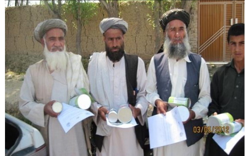
Farmers receiving improved vegetable seeds in Baghlan –e Markaz