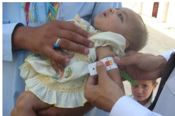
ORCD Surveyors during survey in Kandahar province

ORCD conducted a survey using SMART methodology in Kandahar. We believe the experience ORCD got through conducting this survey could be replicated to other provinces including Baghlan in future.