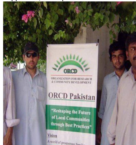
Team of ORCD Pakistan –a local sister setup of ORCD Afghanistan

We believe in the success of development projects, thus we have established partnerships at international and national level. At national level we got affiliated with governmental offices such as Ministry of Women Affairs, Ministry of Public Health, and at bottom level with community development councils (CDCs), and other important local stakeholders such as Aga Khan Foundation (AKF), Afghan Health Services (AHDS), GiZ-DETA, HNTPO, Solidarity for Afghan Families (SAF), Bakhtar Development Network (BDN) and continuously seeking out partners that effectively implement programs promoting human development and rights – through communities.