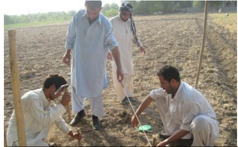
A demonstration on preparing land for optimized vegetable production

Farmers in Baghlan usually produce more or less similar crops and these crops unfortunately fail to give enough yield food shortage occurs. Diversification of agricultural production is deemed a desperate need of its inhabitants and is important because best practices in farming could maximize sources of both income and product. Fruit and vegetable production is one way in which agriculture can be diversified and it is one component of crop production that can contribute to food security of the area. Vegetable production is experienced in many parts of Baghlan province. However, the system of production is backward and as a result, not enough yield is obtained from it. Besides, there are no enough sources of vegetable and fruits seeds for farmers.