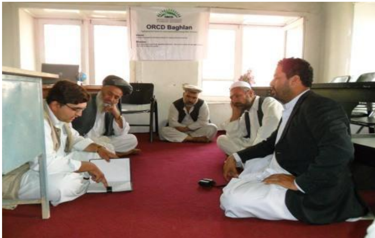
Elders of Baghlan e Markazi actively supported our vegetable production project after this meeting

Throughout the year 2012, ORCD worked with community health shuras in two districts of Baghlan, 3 districts of Daikundi and 2 districts of Kandahar where it implemented various projects.