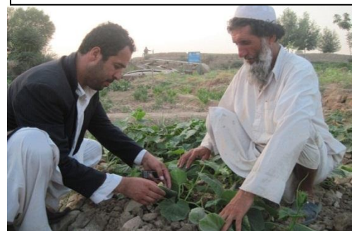
A demonstration about pest control by ORCD trainer

Completing this three-month project in 2012, ORCD found out that the project yielded the intended impacts and effects that had been foreseen during the design of the project. ORCD overcame to make all these accomplishments possible through working with communities, maintaining close collaboration with partner organizations such as CoAR and AWEN in the light of guidance from GIZ-DETA. The contribution of community through community development councils (CDCs) that expressed their satisfaction about services offered through this project was ultimately found highly sustainable given the willingness of farmers and communities in supporting themselves. Some of the important impacts and effects of this project are described as follow: