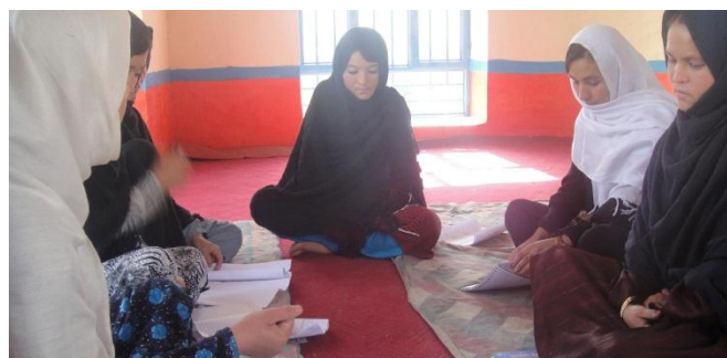
A meeting of family action group in Daikundi province

assigned focal points to conduct focus group discussions, in-depth interviews and fill the pre-designed checklists as part of an extensive assessment to collect data about the real needs of women in their catchment area as well as feasibility of interventions designed accordingly. The assigned focal points who undergo extensive trainings as part of this project are also trained how to maintain community maps of all women in their catchment areas.