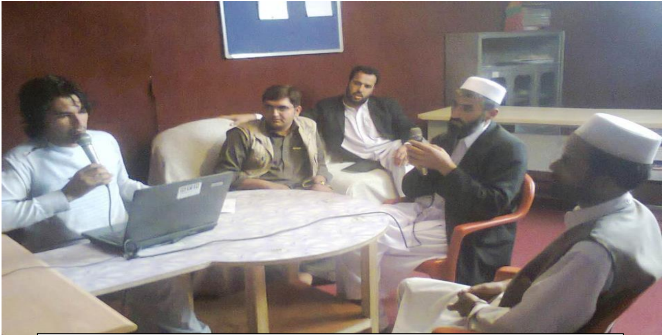
In Baghlan Local Radio Station while recording interview with selected farmers who promoted vegetable production with the support of ORCD with funding from GIZ-DETA in Baghlan