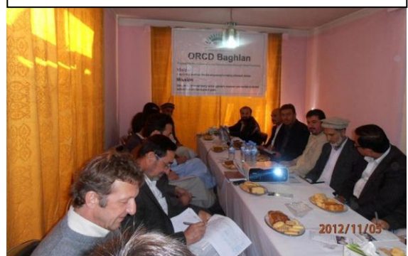
Baghlan NGOs forum meeting hosted by ORCD in Baghlan

The specific objectives are to (1) to improve access of market oriented farmers in remote areas of Baghlan –e Markazi district to diversify land, (2) to enable subsistence farmers, landless inhabitants to have greenhouses by establishing 10 model green houses, (3) to distribute improved seeds to 250 farmers, (4) to offer trainings to 250 farmers