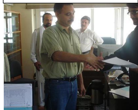
ORCD signing contract of fellowship with Aga Khan Foundation in Baghlan province