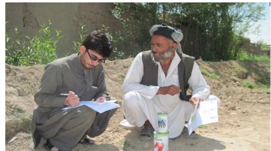
ORCD surveyors during data collection from farmers