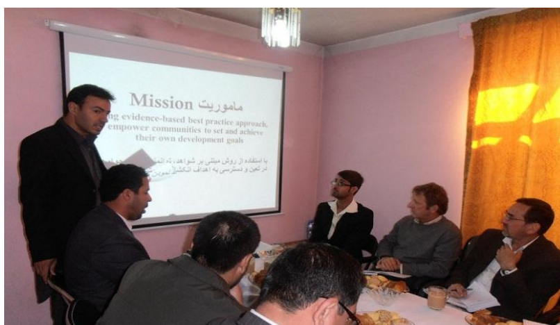
ORCD Representative during delivering a presentation about ORCD mission, vision, objectives and its achievements. The event was hosted by ORCD in Baghlan

The purpose of the fellowship is to have Afghan civil societies promoted and nurtured so that they can take up active leadership in addressing and facilitating sustainable community development in a formal, transparent and professional manner